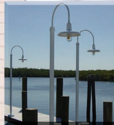
Dock Mounted Post Light