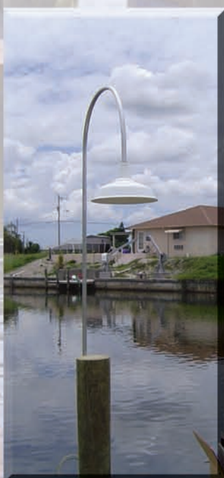
China Hat Gooseneck