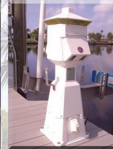
Lighthouse Pedestal with 50A and 30A outlets installed to suit your needs