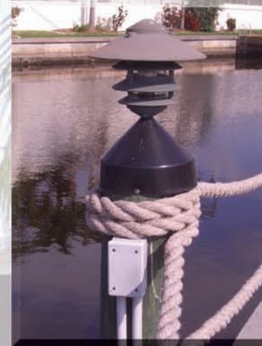
3 Tier bronze installed through cone (cones provided by dock builders)