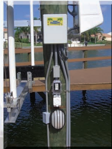
Remote with switch and photocell for lights, GFI outlet, 30A twist lock and black Prisma.