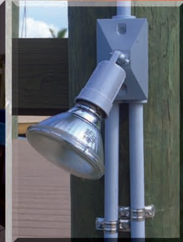
Snook light w/switch & photocell