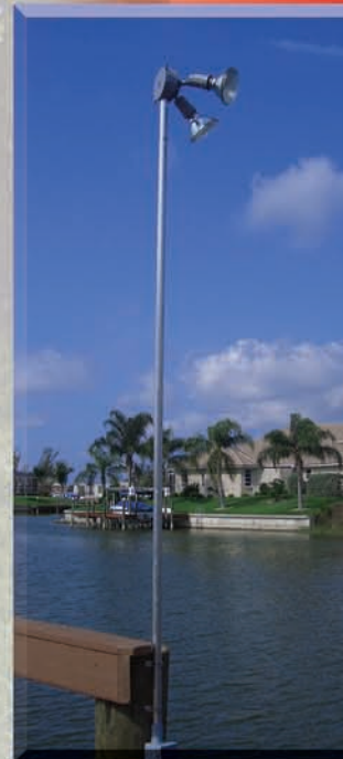
2 - 75W floods on 10' aluminum pipe with switch and photocell