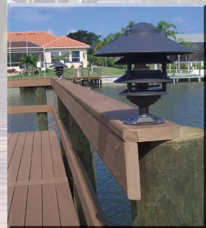
3 Tier bronze installed on hand railing